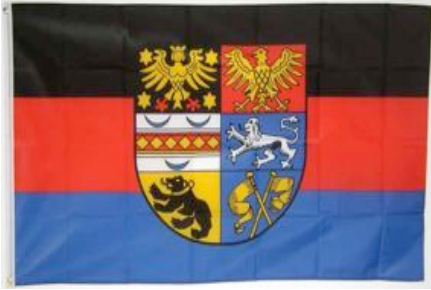
East Frisian Flag and Coat of Arms