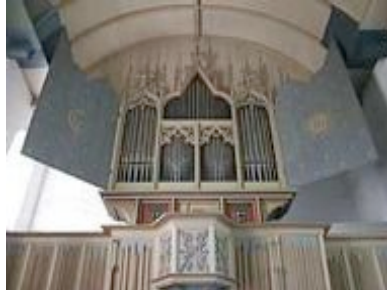
Organ ( 1534) Rysum